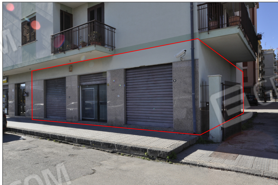
FOTO 1 - Vista esterna Unità Immobiliare -