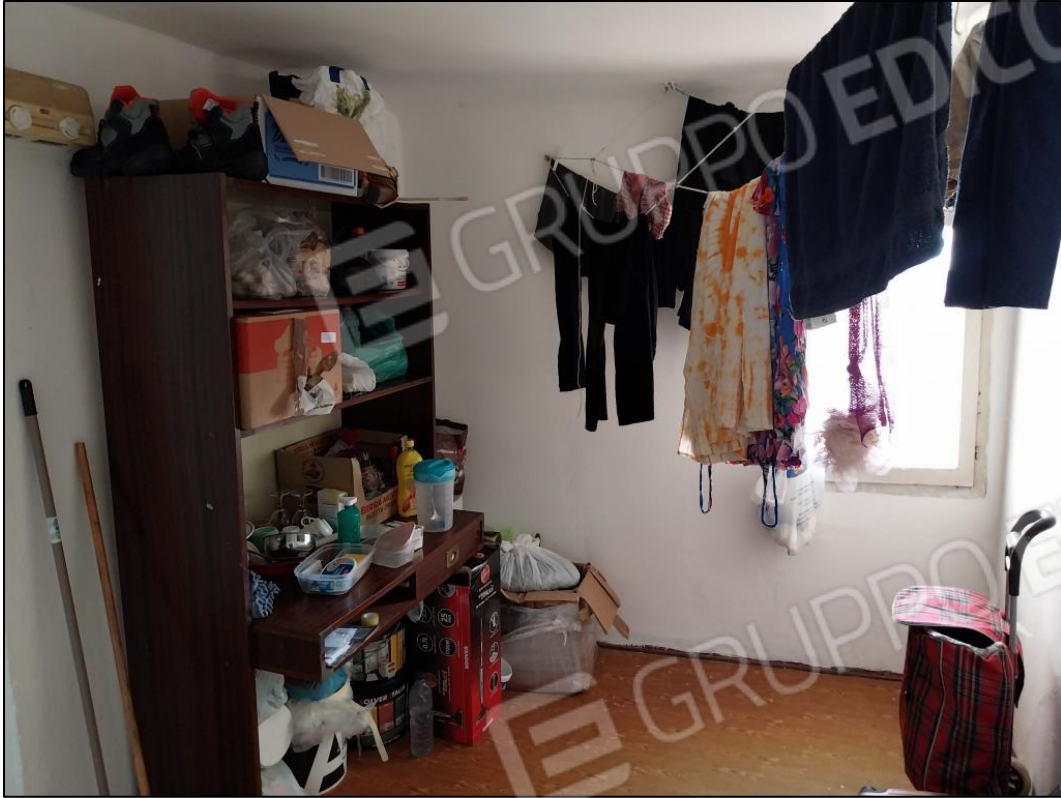
11) Piano secondo - disbrigo