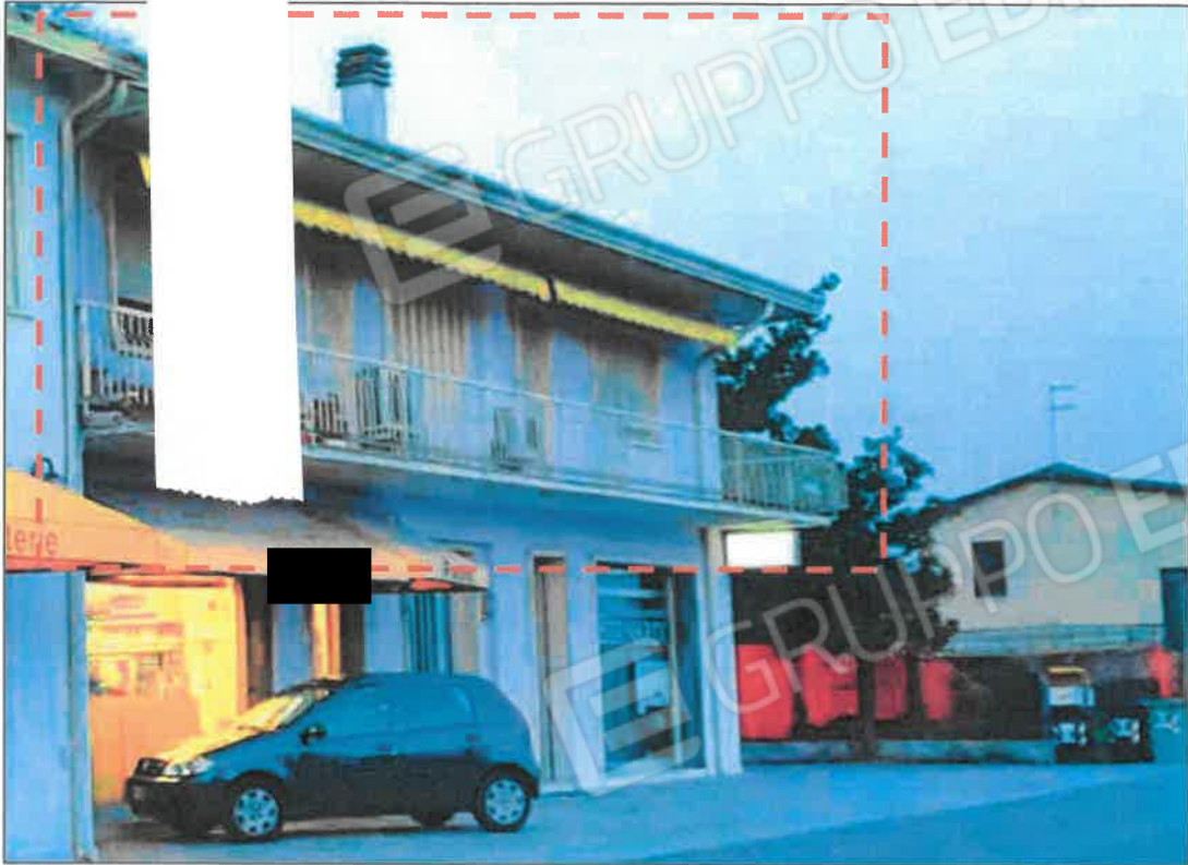
(1 – ESTERNO ABITAZIONE LATO SUD)