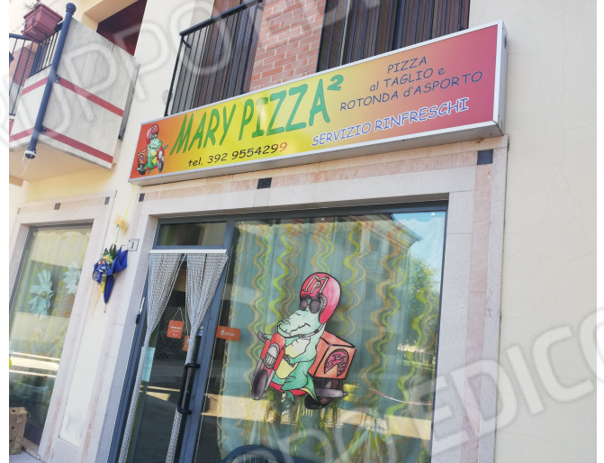
VETRATA D'INGRESSO VISTA DALLA PIAZZA