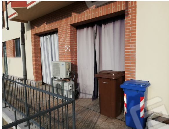
ACCESSI SUL RETRO