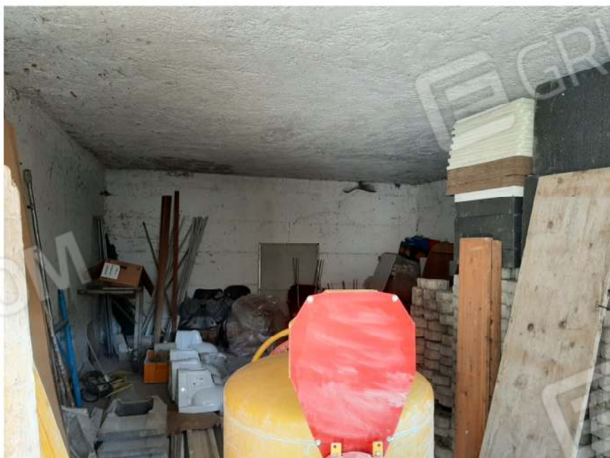
5_SUB 41 INTERNO