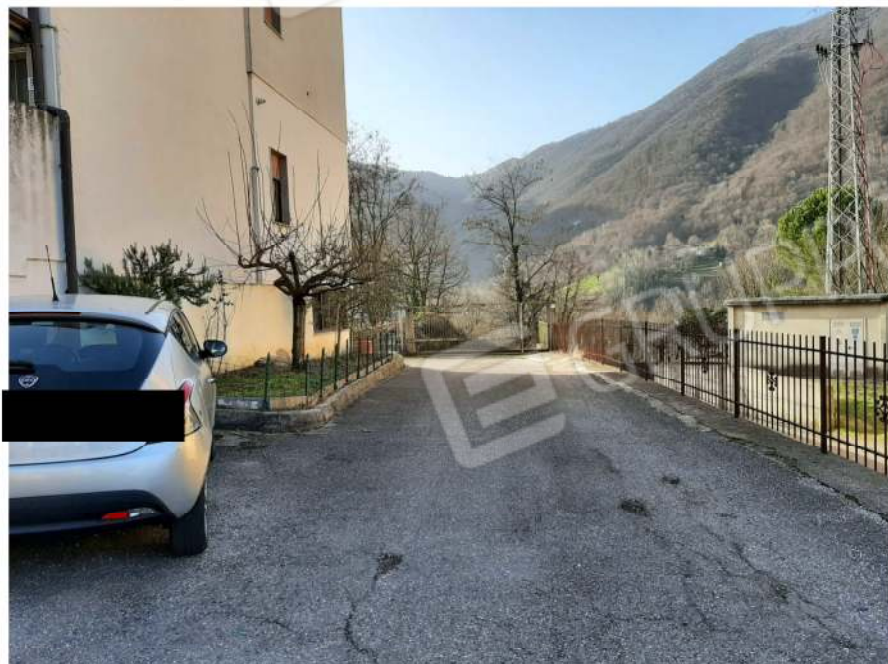
4_SPAZIO CONDOMINIALE SOPRASTANTE (COPERTURA AUTORIMESSE)