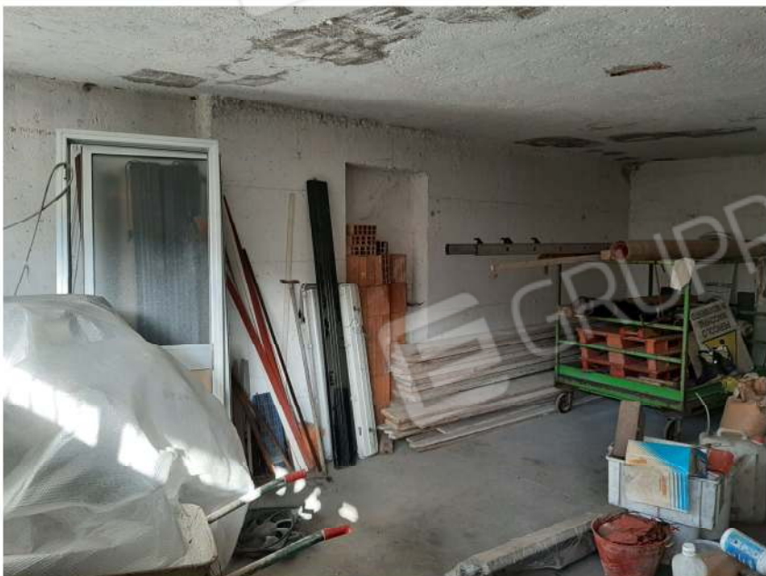
7_SUB 43 INTERNO