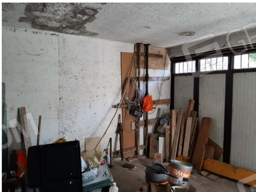
8_SUB 43 INTERNO