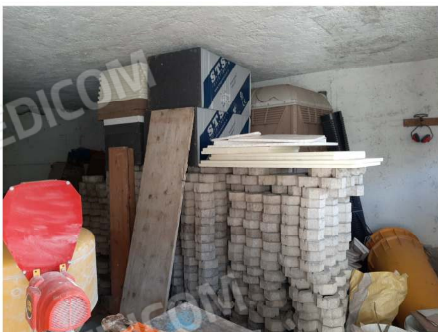
6_SUB 41 INTERNO