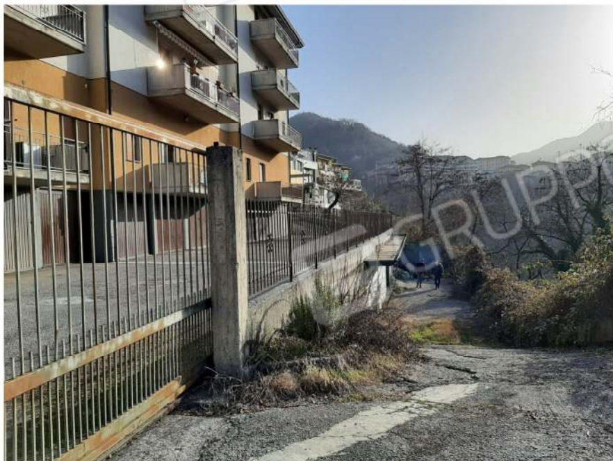
1_ SCIVOLO DI ACCESSO