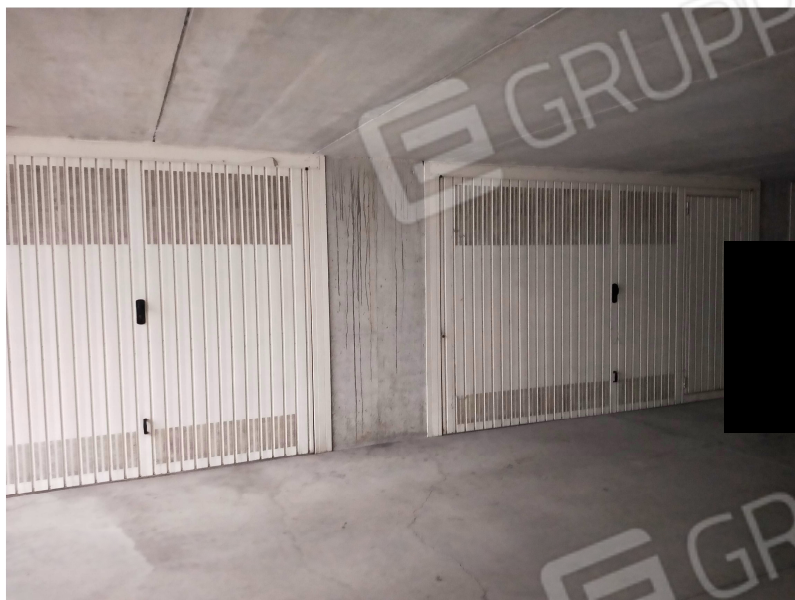
SUB 527 -SUB 528