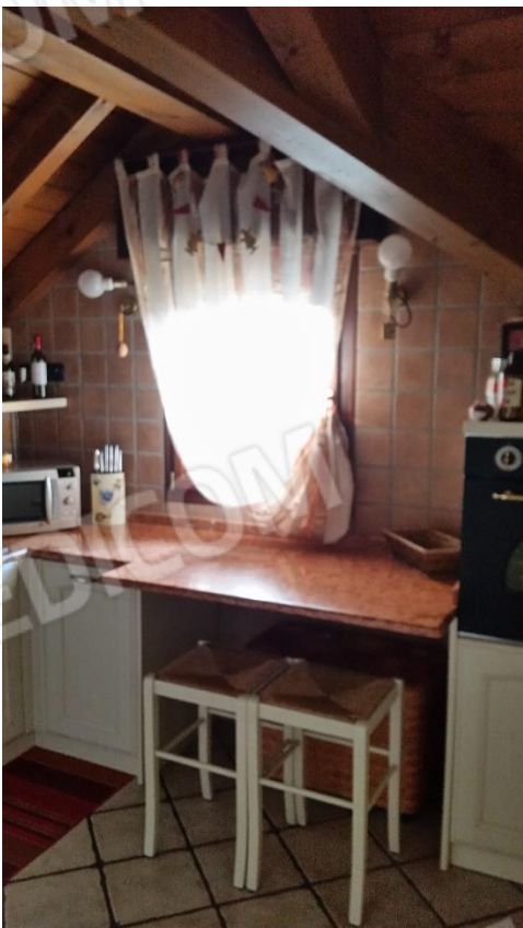
FOTO 3 - CUCINA