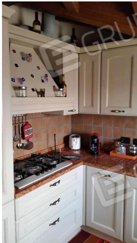
FOTO 4 - CUCINA