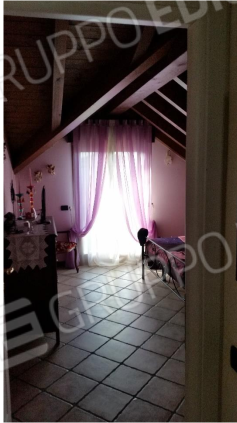
FOTO 2 - CAMERA