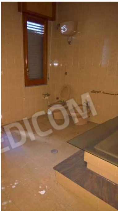
BAGNO – PIANO 1