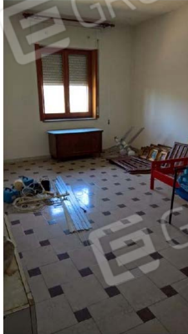
UFFICIO 2 – PIANO 1