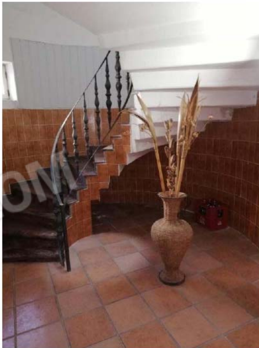
SCALA PIANO S1