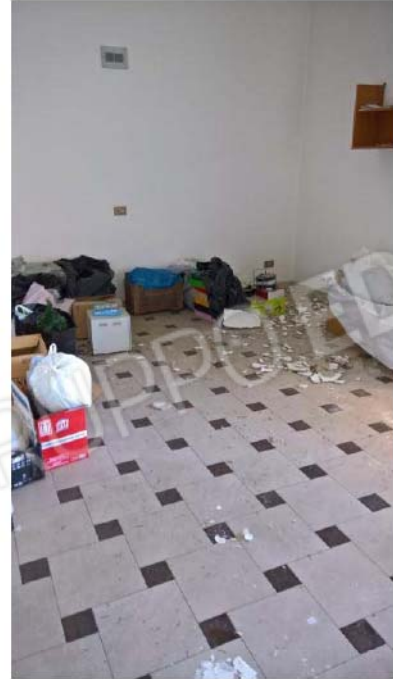
UFFICIO 3 – PIANO 1