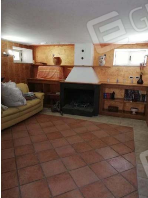
TAVERNA 1 PIANO S1