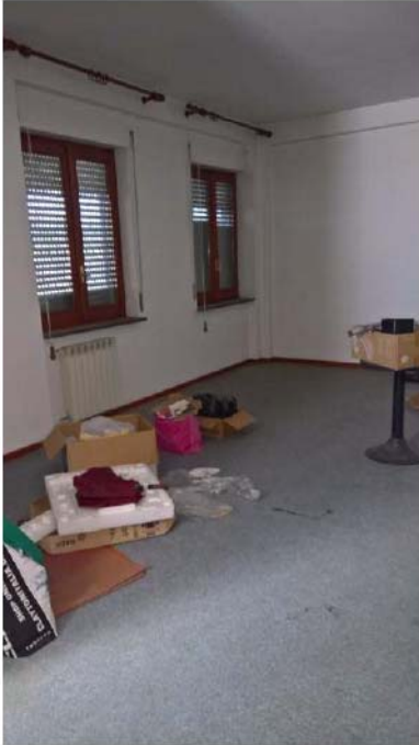
UFFICIO 1 – PIANO 1